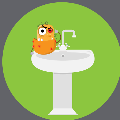
In the bathroom